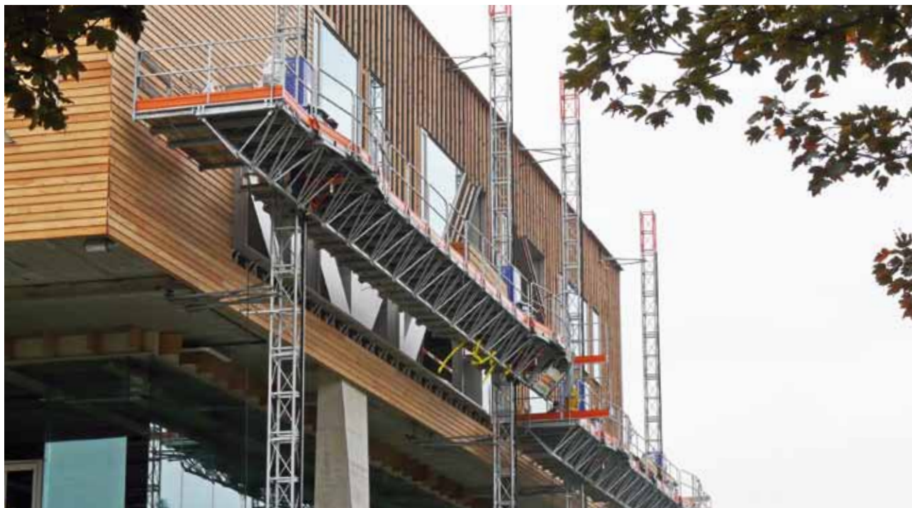
Multiple Twin HEK MCM A machine configurations for façade work. Client: Van Laere. Location: Antwerp, Belgium