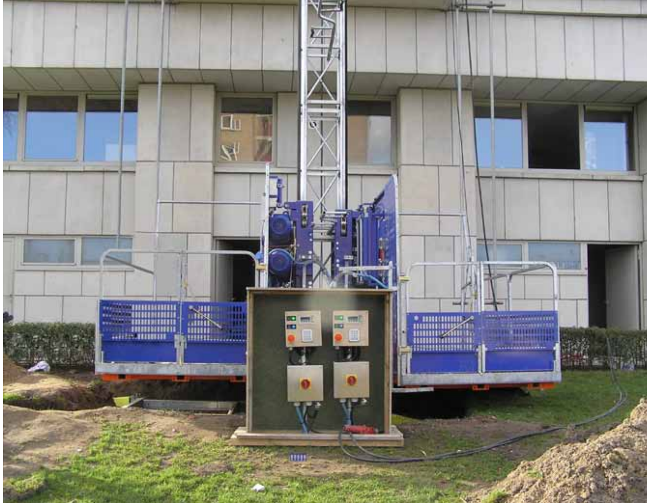
Two HEK TPM 1300SD on one mast used for a renovation project. Contractor: Brebuild. Location: Antwerp, Belgium.